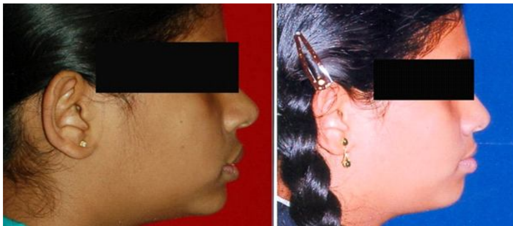
Fig. 3a: Comparison of software predicted image with post treatment profile photograph