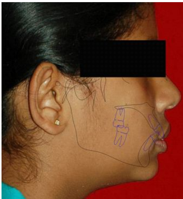
Fig. 2a: Patient profile photograph with superimposed digitized cephalometric structures